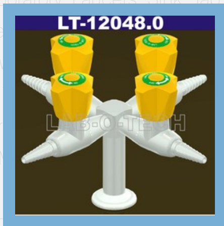
4 Way Standout (90 MM Standout)