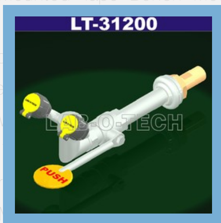
Wall Mounted Eyewash With Flag Handle