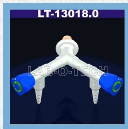
Wall Mounted "Y" Tap With 90 Degree Nozzle