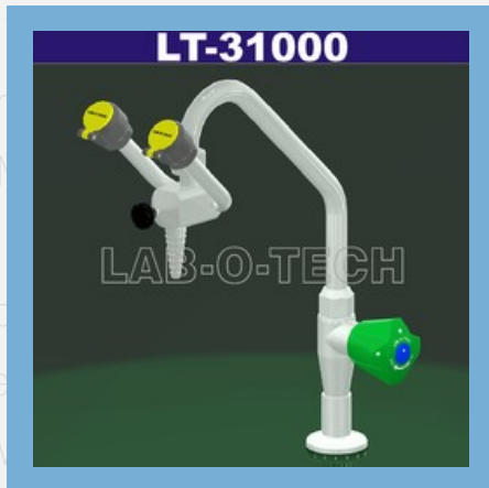
Emergency Eyewash With Swivel Spout With Valve