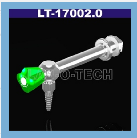
S.s Wall Mounted Straight Tap With 90 Degree Nozzle