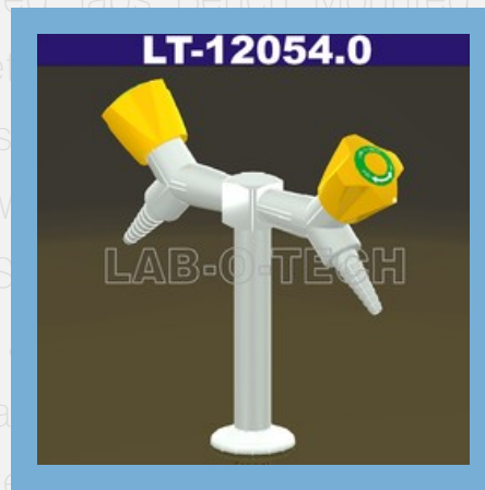
Two Way Bench Mounted Gas Tap