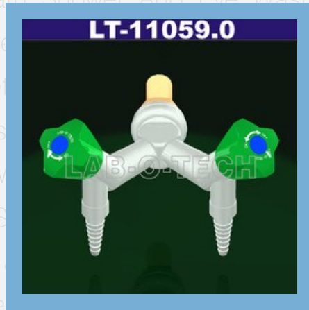
"Y" 90 Degree Wall Mounted Tap