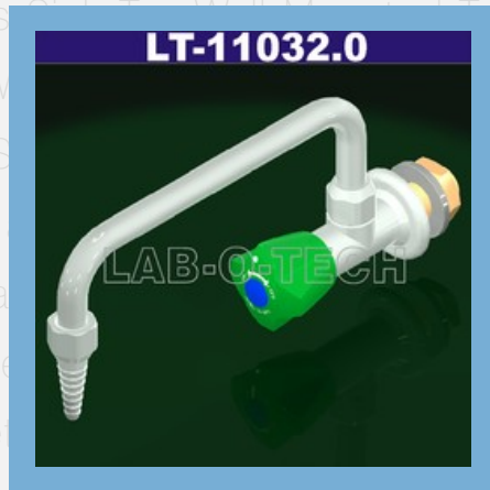
Wall Mounted Tap With " U " Swilling Spout