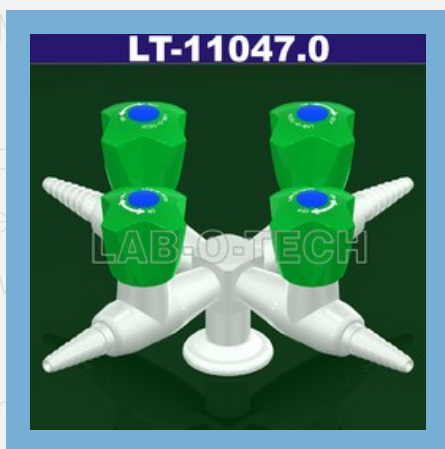
4- Way Standout 45MM

All fittings are protected by a surface treatment of Polyester powder coat which is highly resistant to most chemicals.