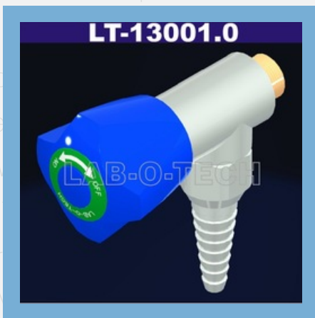
Wall Mounted Gas Tap 90 Degree Nozzle