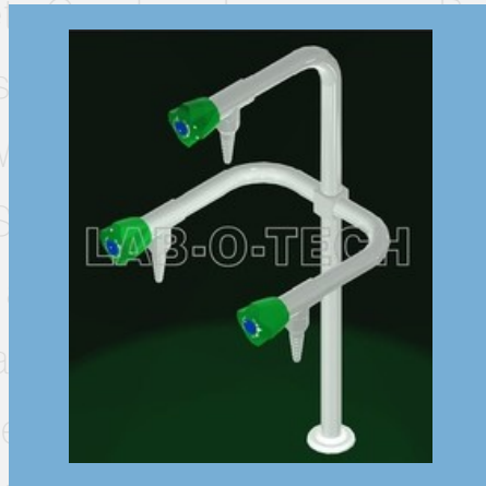
Laboratory Service Fittings