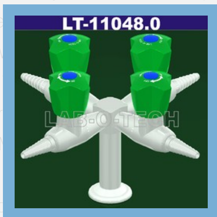
4- Way Standout 90MM