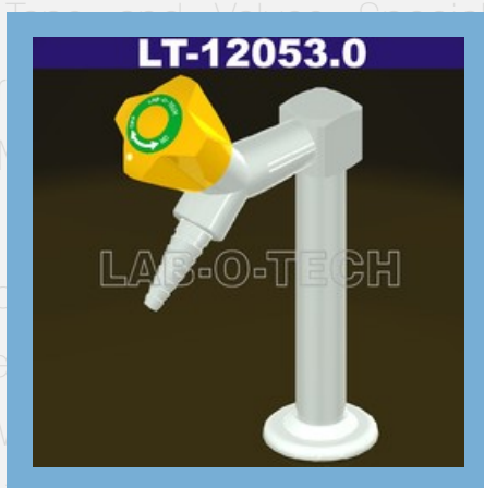
One Way Bench Mounted Gas Tap