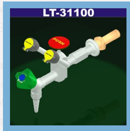
Wall Mounted Eyewash With Fountain