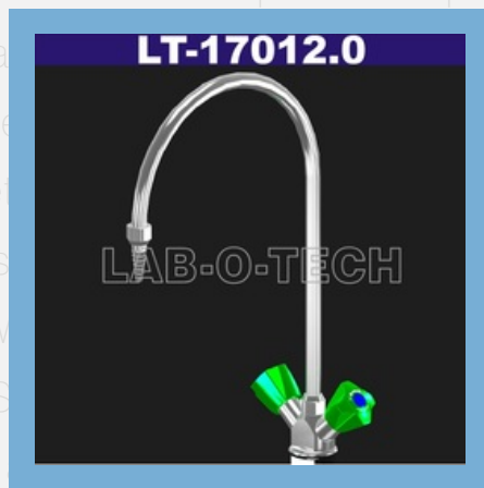
S.S Bench Mounted Mixer Valve Hot & Cold