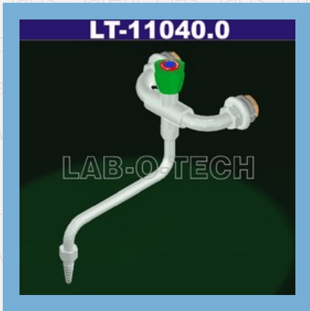
Wall Mounted Tap With Mixer Swilling Spout