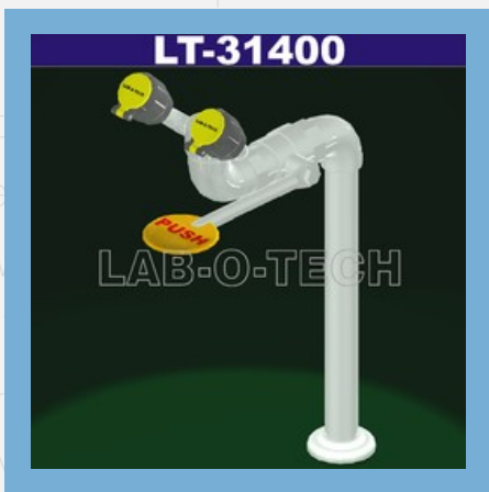
Bench Mounted Eyewash With Fountain