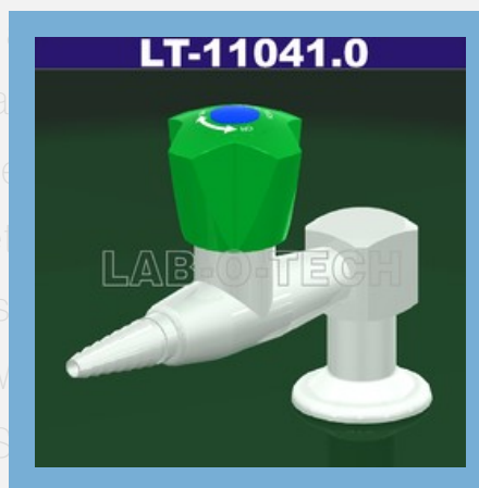
Bench Fitting With 1 Column Standout 45MM