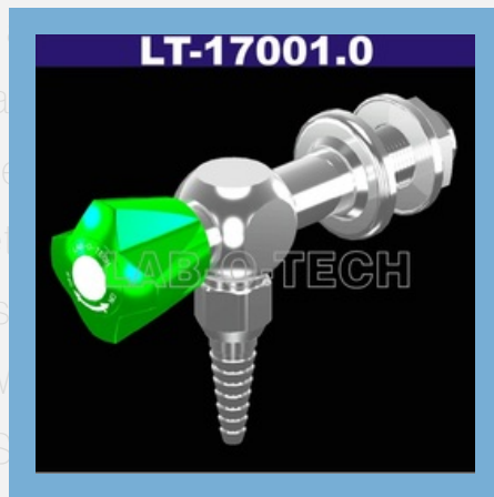
S.S Wall Mounted Straight Tap With 90 Degree Nozzle