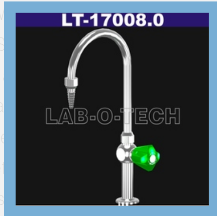
S.S Bench Mounted One Way Valve With Swivel Spout