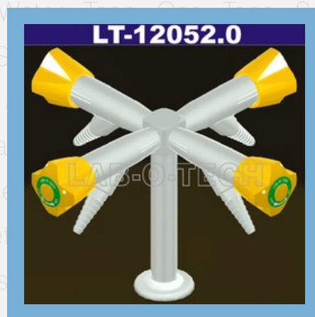
4 Way Bench Mounted Gas Tap With 45 Degree Nozzle