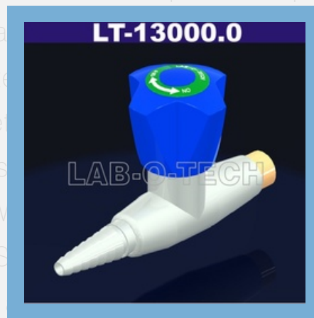
Suspended Mounted Gas Valve