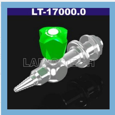
S.S Wall Mounted Straight Tap

All fittings are protected by a surface treatment of Polyester powder coat which is highly resistant to most chemicals.