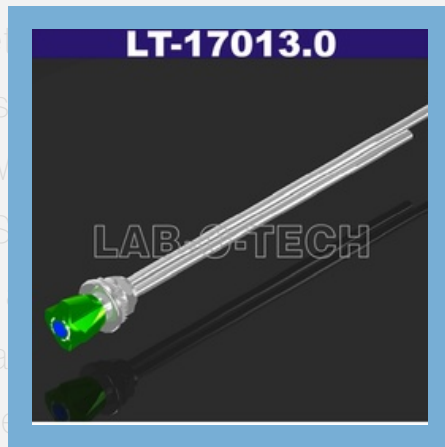
S.S Panel Mounting Valve