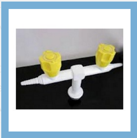
School Lab Taps