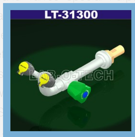
Wall Mounted Eyewash With Knob Operated