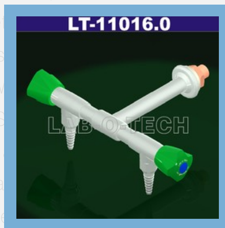
Wall Mounted T- Tap With Nozzle 90 Degree