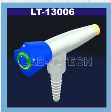
Suspended Wall Mounted 90 Degree Gas Tap