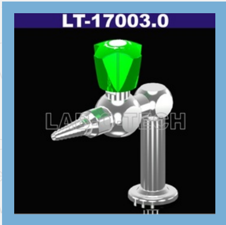
S. S. Bench Mounted One Way 90 Degree Valve

Creating a niche of Bench Mounted Taps and Valves such as S. S. Bench Mounted One Way 90 Degree Valve, S.S Bench Mounted One Way Valve With Swivel Spout, Bench Mounted Eyewash With Fountain, S.S Bench Mounted Mixer Valve Hot & Cold, S.S Bench Mounted Two Way Valve, S.